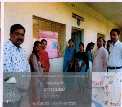
Students presenting Wall paper